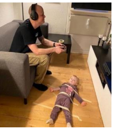
Ensuring the kids are safe.