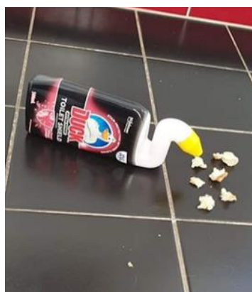
Feeding the duck (Warren Lush)

Traditionally today is a day to be wary, well it is up to midday, but this year the fun of the 1st of April has certainly been ripped out of the day as we prepare to enter week two of lockdown. We sit it out at home, moving our way through the various streaming platforms utilising the free trials the internet offers. Searching for both valuable information and a bit of comic relief to keep our spirits up. This enforced time also gives us all time to reflect on the past. The Club has been doing this, posting daily a photo of times gone past on facebook and viewing numbers are impressive. The Club and greens may be closed but members are still able to interact via the internet and they are certainly doing that as some of the photos in this issue show.