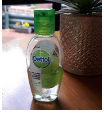
"Don't worry kids. I was cleaning out cupboard, and I found the family fortune".